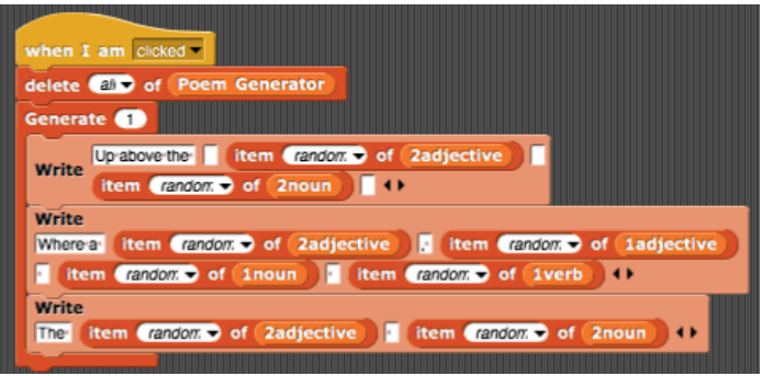
Figure 2. 'Programming' the poems

After the words had been entered, sentence patterns for the poem need to be input. The 'generate' C-shaped block in the scripting area controls the poem generator on the stage. Multiple poems can be repeated using the numeric input contained within the block. Each time a 'write' block is used, a new line will be started. Within each line, some words can remain constant each time. It is also possible to pick a random item from one of the word lists ( see figure 2).